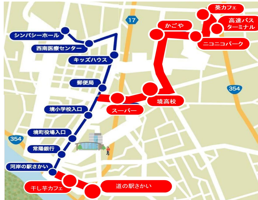
Example: Sakai-town Ibaraki Prefecture