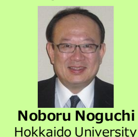
Tech. for Creating Next-Generation Agriculture, Forestry and Fisheries