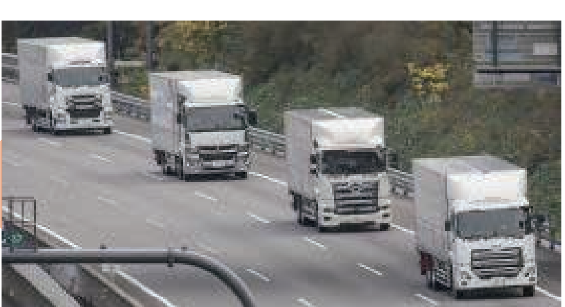
FOT of 4 brands truck CACC+LKA. Dec, 2018 (Time to Collision: 1.6 sec 80km/h)

FY2021 Commercialization of 4 brands truck CACC+LKA.