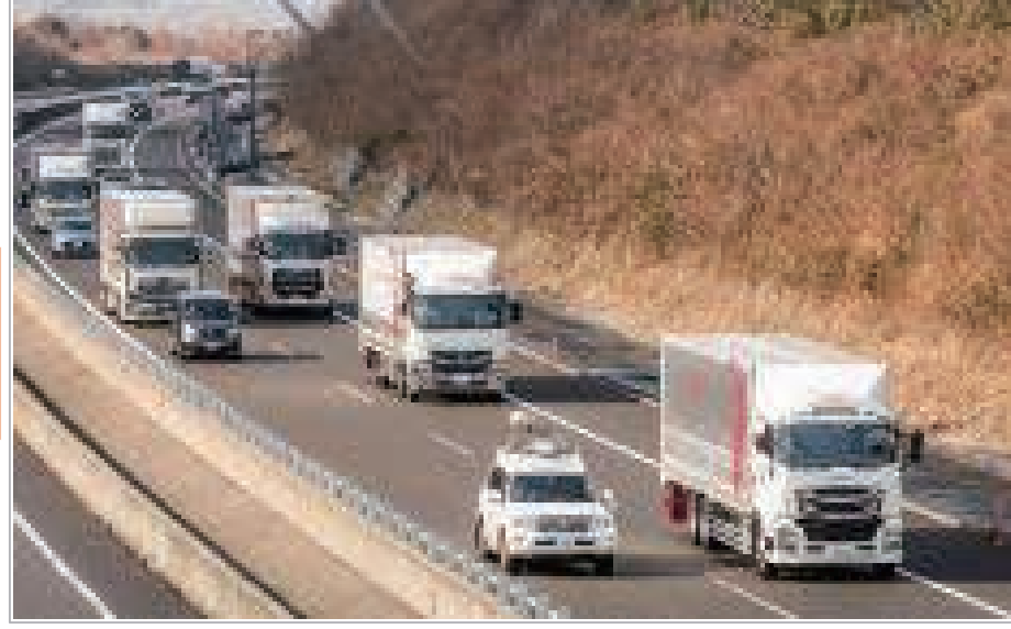
FOT of 4 brands truck CACC. Jan, 2018 (Time to Collision: 1.6 sec 80km/h)

Jan,2018 World first 4 brands truck CACC.