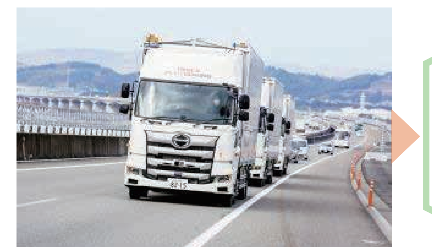
FOT of CACC+ Lead Truck Following System. Jan-Feb, 2018 (Time to Collision: 0.5sec 70km/h)

FY2020 First FOT of CACC+ Lead Truck Following