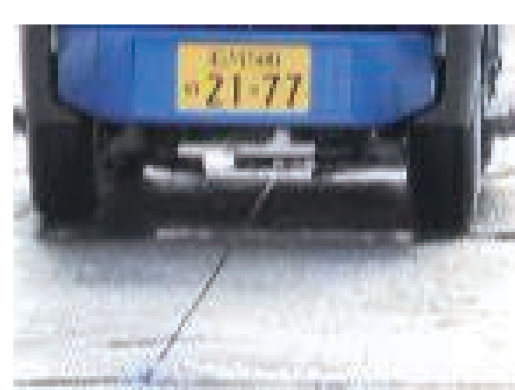
Automated steering using electromagnetic induction cable (Wajima, etc)