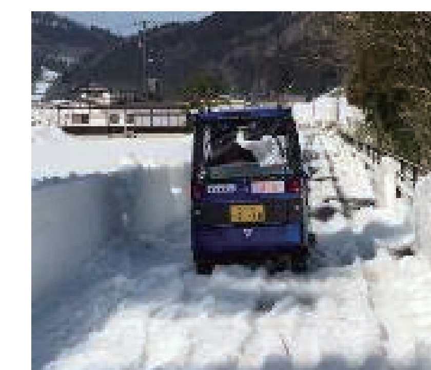
Verification of driving condition at snow-covered road (Eiheiji)