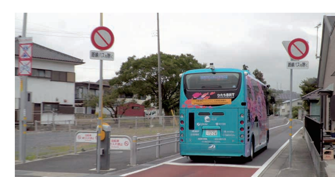
State of automated driving demonstration in BRT route (Hitachi)