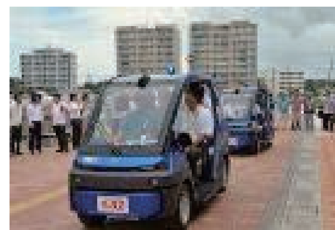
State of automated driving demonstration (Chatan)