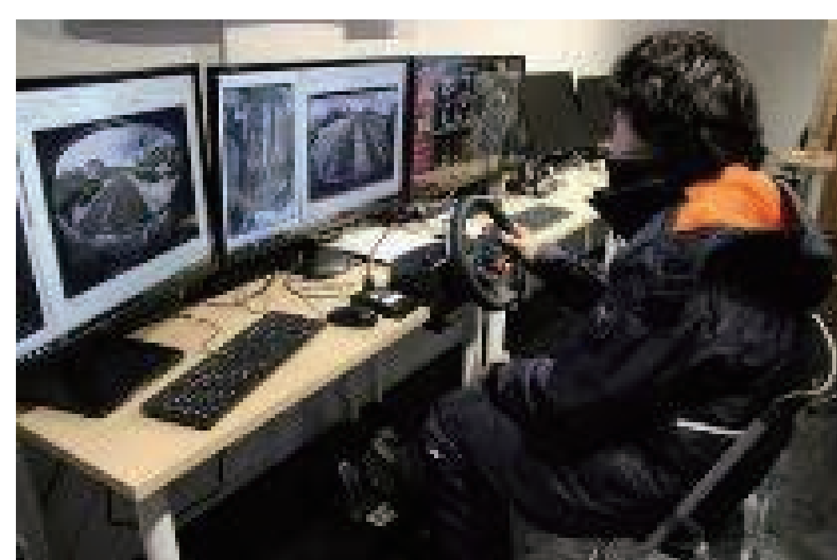
State of the remote monitoring and operation (Wajima)