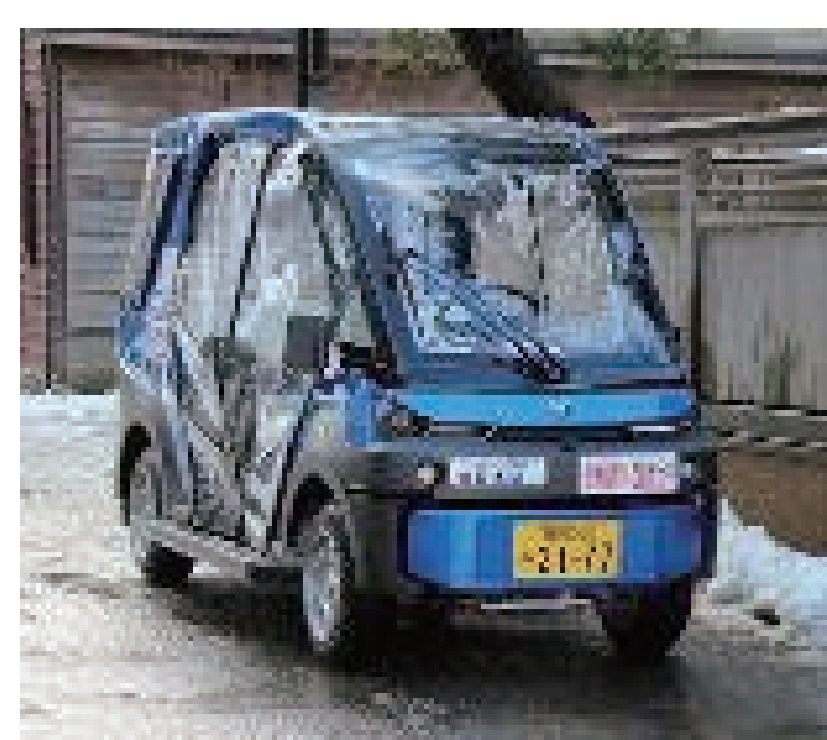
Demonstration in a completely unmanned vehicle (Wajima)