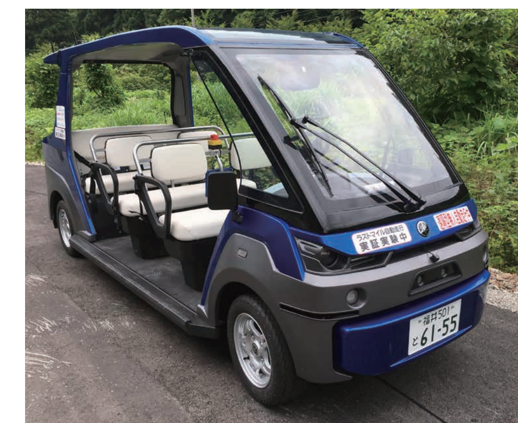
“Smart E Cart”