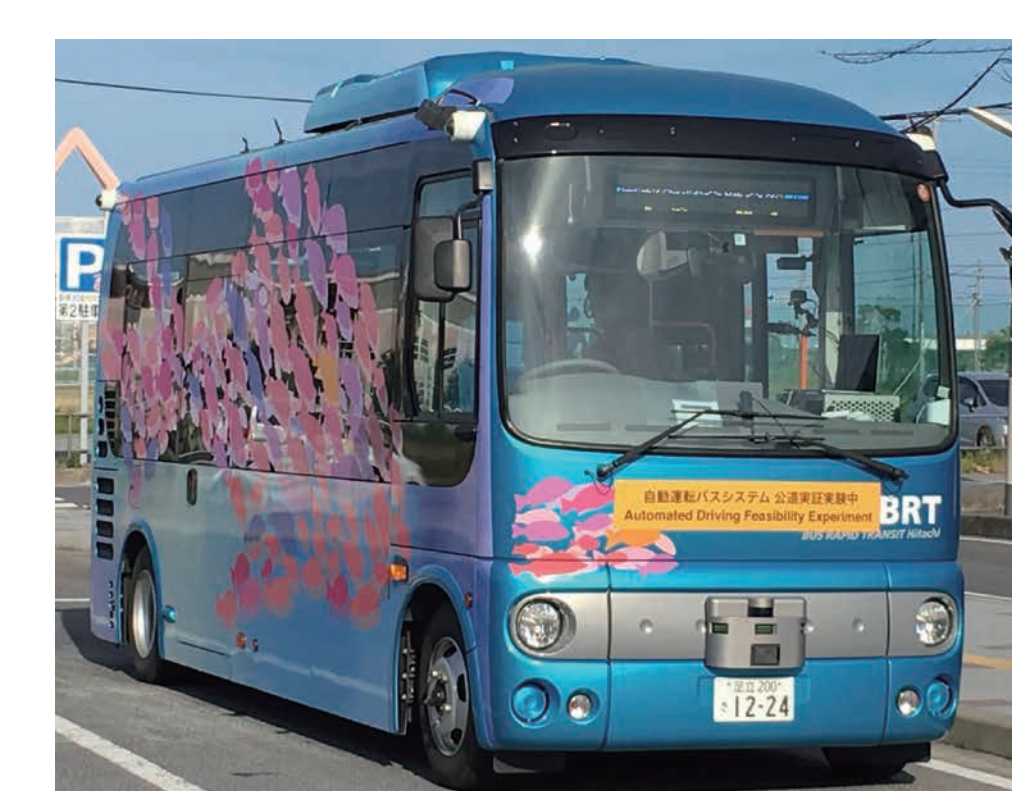
“Smart bus” Experimental vehicles